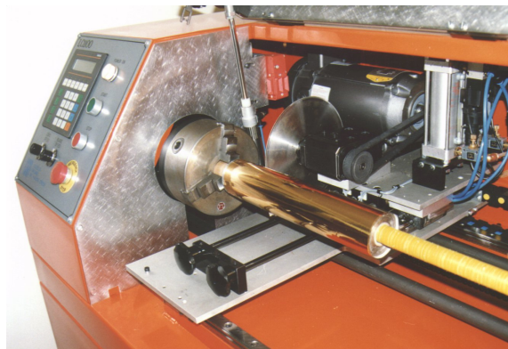
Jaw chuck log grip.